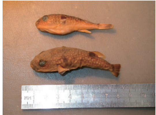
Fig. 3. Takifugu poecilonotus collected from Sakhalin Island: ZIN 31566 (one of 6 specimens.), ZIN 31567 (one of 20 specimens).

cially important. In addition to this, Gastrophysus has frequently been applied to puffers of the genus Lagocephalus , which contains about 10 species, including edible species (at least muscle is edible in L. inermis , L. gloveri , and L. spadiceus ) and strongly toxic species such as L. lunaris and L. sceleratus . In Chinese publications the generic name Gastrophysus is still applied to species of Lagocephalus . Thus, if Gastrophysus is applied to species of Takifugu , it would result in major confusion in the classification of puffers in East Asia. When considering food security and fishery industry sustainability we should be careful about the use of generic names of puffers. Matsuura (2015) has stated that he would request the International Commission on Zoological Nomenclature to suppress Gastrophysus . Considering this situation, we use generic name