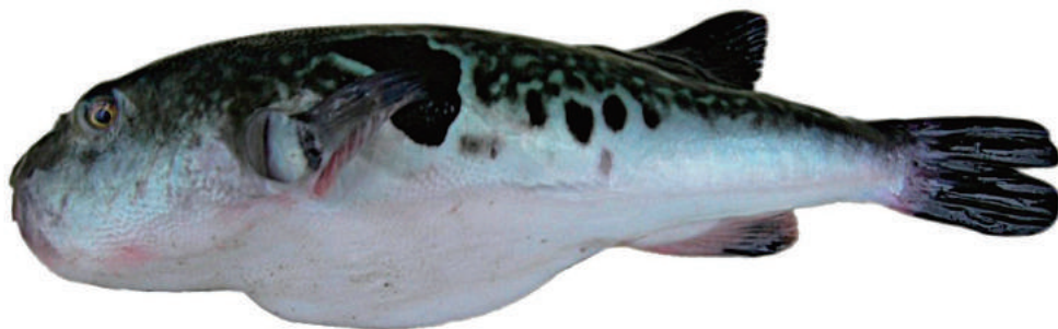
Fig. 4. Takifugu rubripes (242 mm SL) collected around the mouth of Lyutoga River in Aniva Bay, Sakhalin Island.

2007, 2011), although it is commonly found in the waters of Japan and Korea (Amaoka et al. , 1989; Kim et al. , 2009).