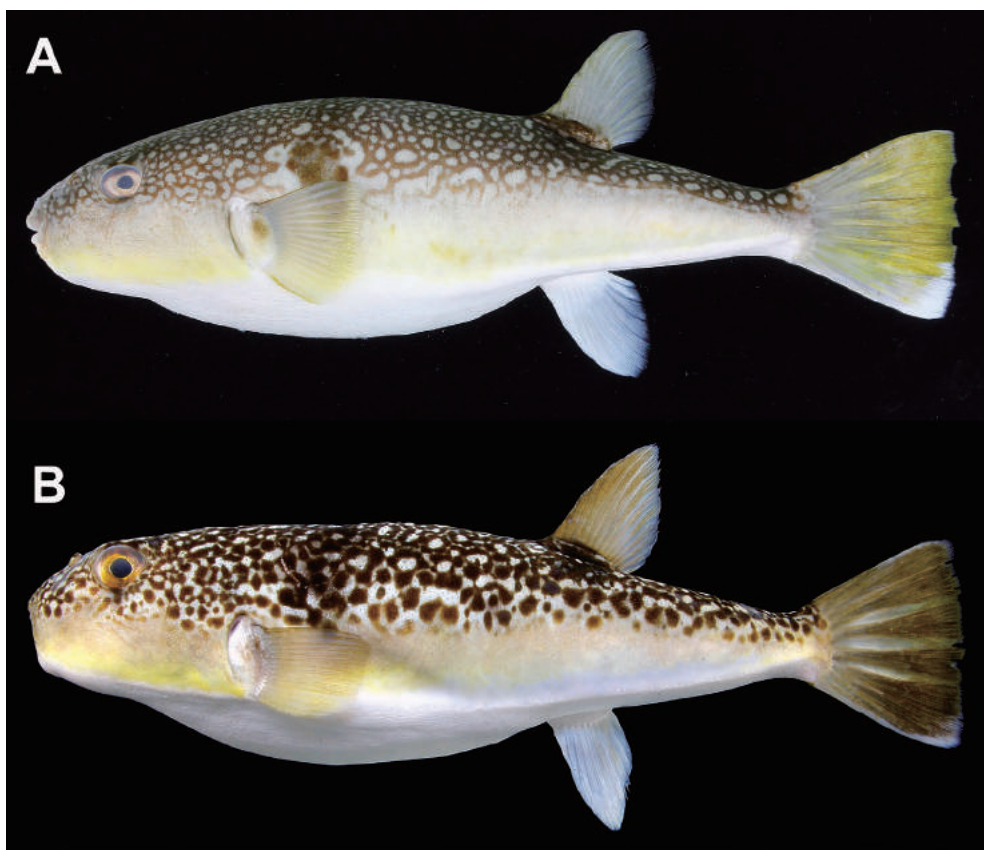
Fig. 5. A, Takifugu vermicularis (Temminck and Schlegel, 1850), FAKU 139922, 222 mm SL, Maizuru, Sea of Japan; B, Takifugu snyderi (Abe, 1988), KAUM-I. 27764, 166 mm SL, Satsuma Peninsula, Kyushu, Japan.

Russian waters, sometimes many individuals were captured in Peter the Great Bay (e.g., 1 ton catch in August 2001, see Orlov, 2013).