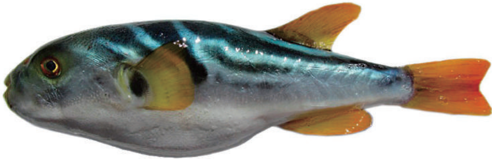
Fig. 6. Takifugu xanthopterus (175 mm SL) collected around the mouth of Lyutoga River in Aniva Bay, Sakhalin Island.